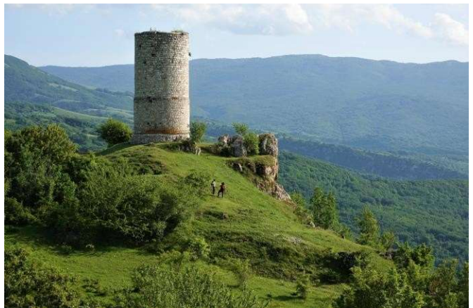
Sperone, hamlet of Gioia dei Marsi