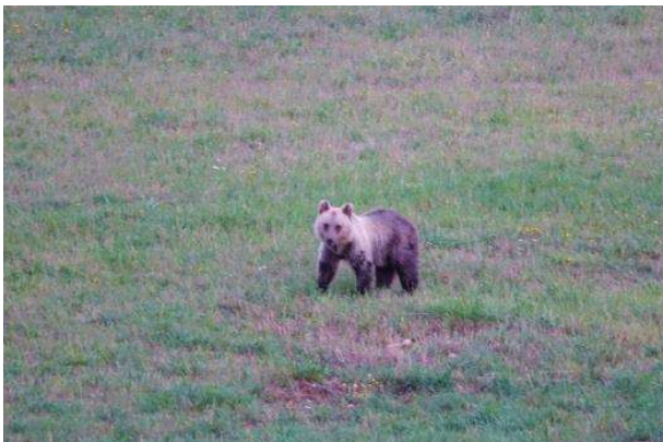
Marsican brown bear

Note: because of the current situation due to Covid19 we are flexible with dates. Please contact us to make arrangements regarding the date of your arrival.