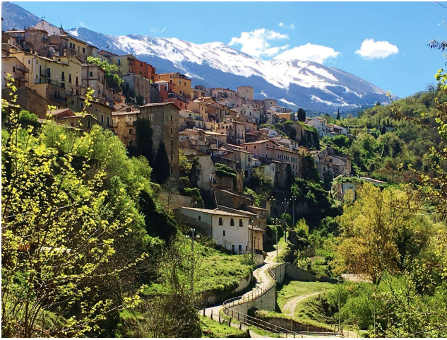
Pettorano sul Gizio