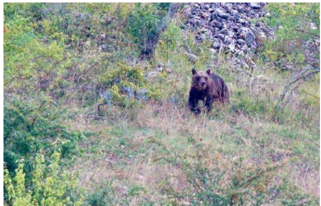
Marsican Brown Bear