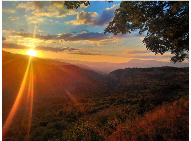
Observation point at Gioia Vecchio, Municipality of Gioia dei Marsi