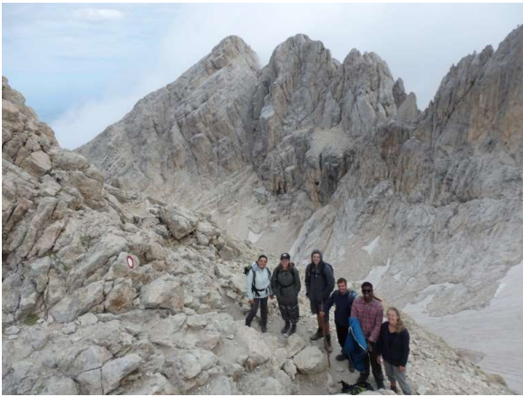
Gran Sasso National Park