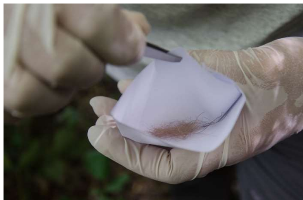
Collection of bear hairs