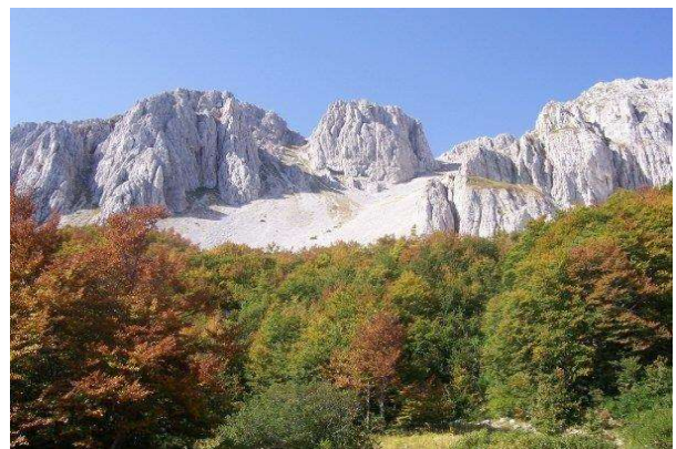
Sirente Velino Regional Park